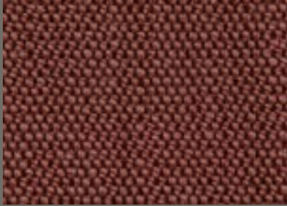
Dusky Pink 206